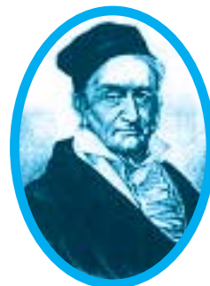
Carl Friedrich Gauss (1777 – 1855)

Carl Friedrich Gauss is often referred to as the 'Prince of Mathematicians' and is considered one of the three greatest mathematicians of all time, along with Archimedes and Newton. He has made fundamental contributions to both mathematics and science.