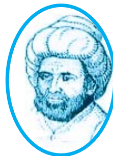
Muhammad ibn Musa al-Khwarizmi (A.D. 780 – 850)

A lemma is a proven statement used for proving another statement.