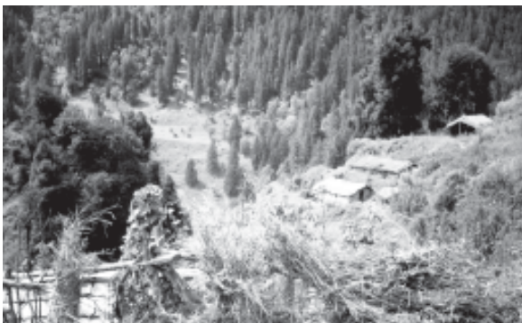
Figure 16.2 A view of a forest life

Let us take a look at what each of these groups needs/gets out of the forests. The local people need large quantities of firewood, small timber and thatch. Bamboo is used to make slats for huts, and baskets for collecting and storing food materials. Implements for agriculture, fishing and hunting are largely made of wood, also forests are sites for fishing and hunting. In addition to people gathering fruits, nuts and medicines from the forests, their cattle also graze in forest areas or feed on other fodder which is collected from forests.